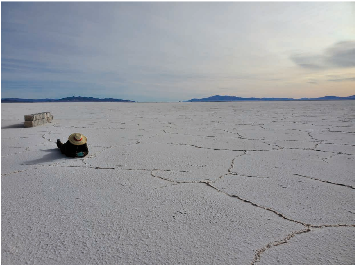
Salinas Grandes Andean Salt Flat. August 2023

The Andean salt flats of Argentina, Chile and Bolivia hold approximately 70% of world reserves of lithium in the form of brines. 44 These underground deposits of water and salts within the salt flats have high concentrations of lithium, and their exploitation is the easiest and most economically profitable of all methods for extracting the mineral. For this reason, the Puna region shared by the three countries is also known as the “Lithium Triangle”. 45