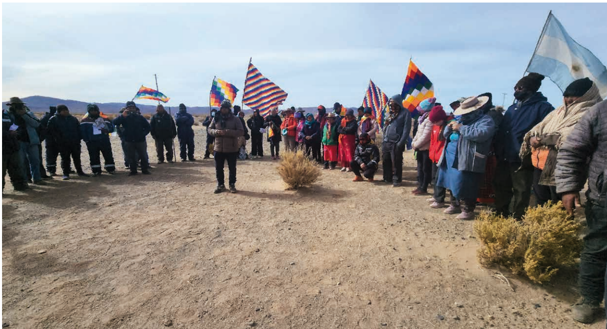
Demonstrators from the indigenous communities of the Salinas Grandes Basin and Laguna de Guayatayoc wave whiplas at the junction of Abrapampa and Moreno. August 23, 2023.

In Purmamarca, the mission gathered testimonies indicating the desecration of sacred spaces and disrespect for indigenous cultural identity, including the removal of symbols such as the Wiphala 182 or Viltipoco. 183 According to one of the testimonies received, “Sacred spaces were desecrated, they took down the Wiphala, they removed Viltipoco from the square, they want to erase our culture.”