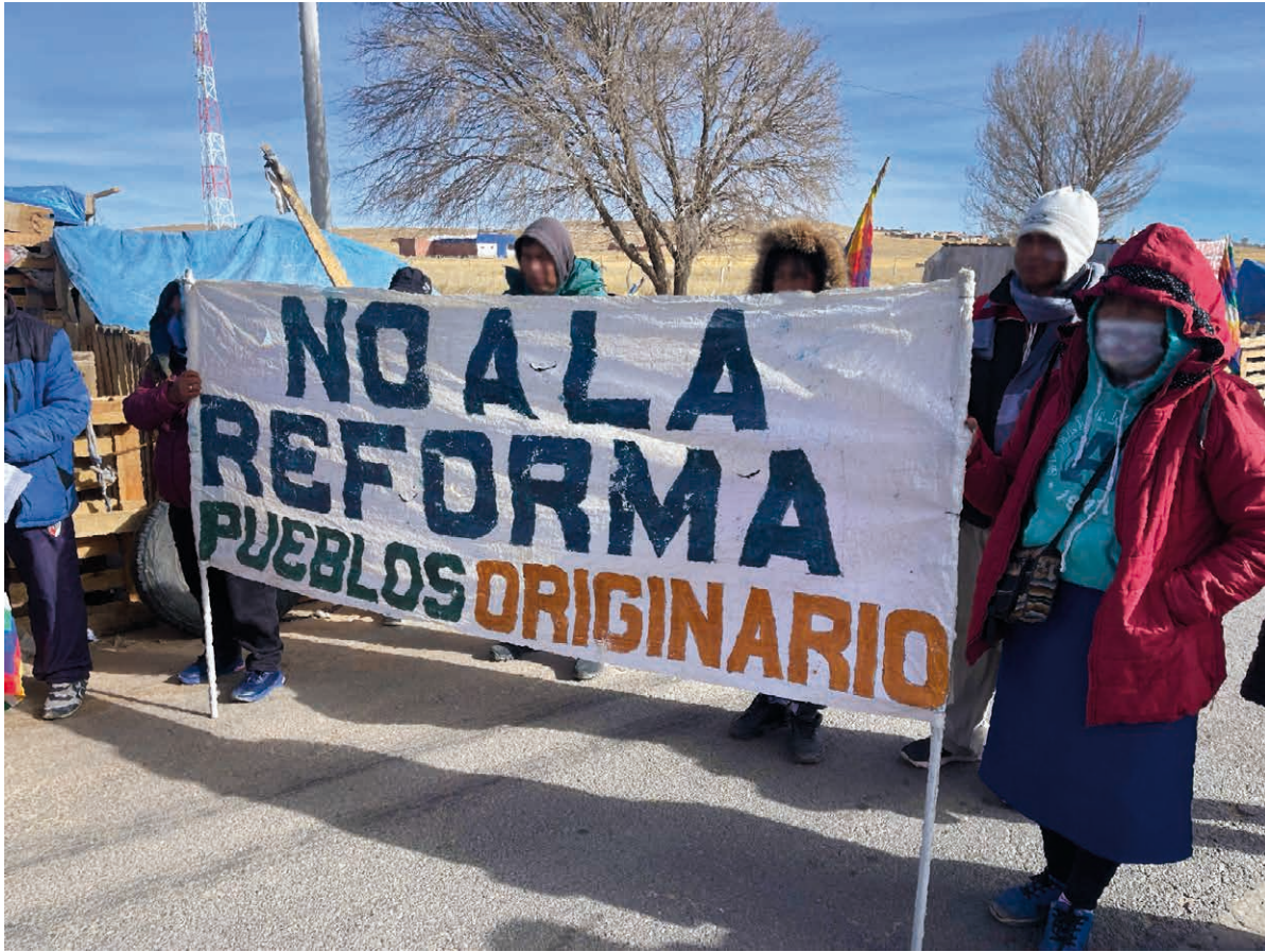
"No to the reform. Indigenous peoples". Demonstration of indigenous communities against constitutional reform held on national route 9 at the access to La Quiaca. August 23, 2023

The violation of the rights to free, prior and informed consultation and to participation continued throughout the constitutional reform process, despite the express requests of the indigenous peoples to have mechanisms for the effective exercise of their rights. In this regard, the international fact-finding mission had access to a petition, submitted on 31 May 2023, in which representatives of the Guaraní, Ocloya, Tilian, Omaguaca, Kolla, Quechua and Chicha peoples asked to be heard by the pro-government bloc of the Constitutional Convention, as well as for the application of international principles on the right to free, prior and informed consultation.