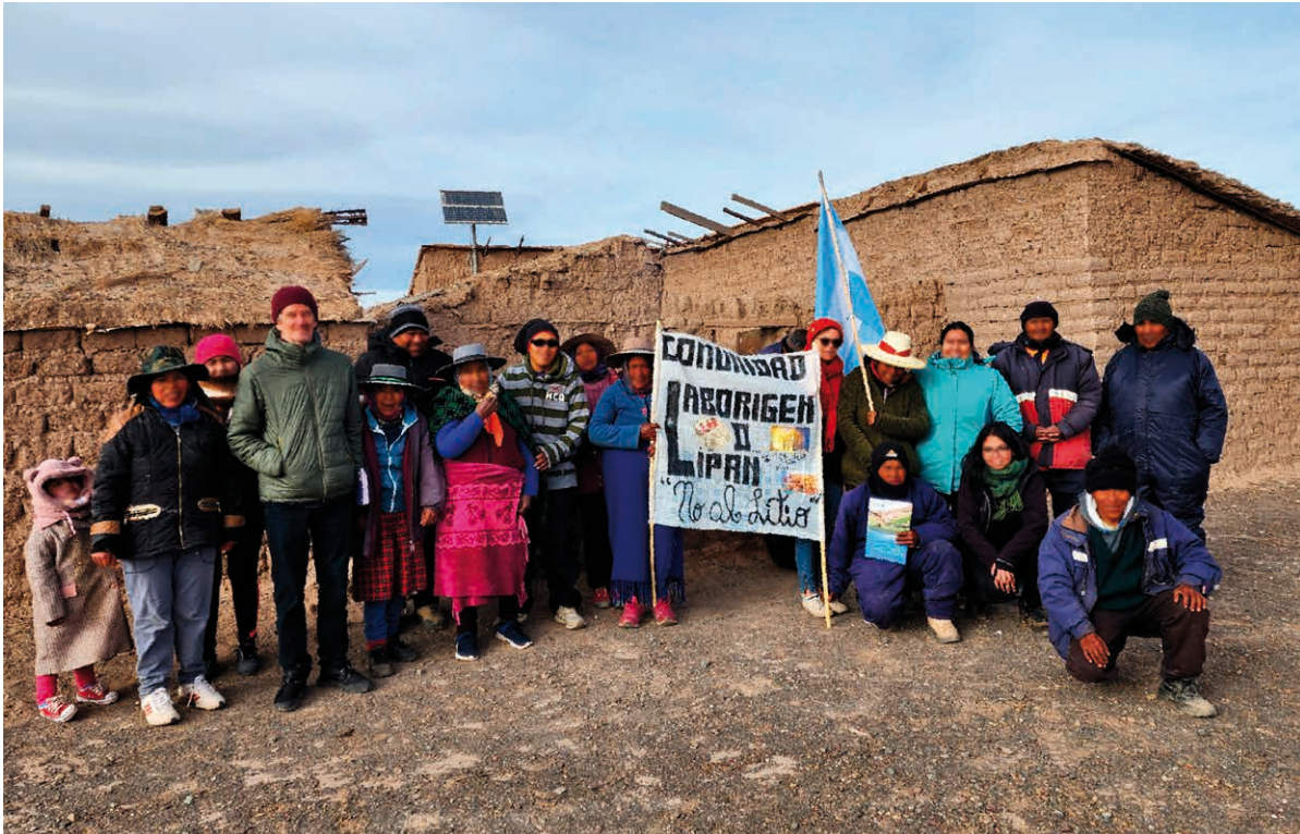
Visit of the international observation mission to the Kolla Lipán indigenous community in Salinas Grandes. August, 2023

According to testimonies gathered in meetings with community representatives, as well as documents handed over to the international fact-finding mission, the project was approved without prior information, during a meeting held with a few people from the community, convened by the Municipal Commissioner of El Moreno, with the presence of the provincial government and representatives of the companies JEMSE and Lithos S.A. The representative institutions of the community did not participate in the meeting.