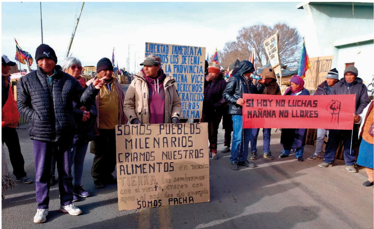
“We are millenary peoples. We raise our food on our land, we sow it with the wind, it grows with the water, the sun gives it energy. We are Pacha”. Demonstration of indigenous peoples of the Puna against the constitutional reform. August 2023

An indigenous leader from Abra Pampa underlined the lack of legitimacy of the new provincial Constitution, given the exclusion of indigenous communities from crucial decisions on the future of their ancestral territories: “They steal our wealth, they give us crumbs. They pollute our land. We have nothing, this constitutional reform is not for us; we have been excluded from the whole process at every step and we don’t have the capacity to change it or even get help from the courts because they will just do whatever the Governor wants to do.”