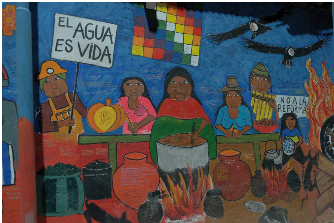
«Water is life. No to the reform». Mural alluding to the constitutional reform, with messages aimed at respecting the right to water. Purmamarca, August 2023

The new constitutional provision does not adequately address integrated management of basins, nor does it recognise the traditional uses of water by indigenous communities. On the contrary, it prioritises the large-scale exploitation of water sources, thus making it easier for water to be used in lithium extraction projects, which are also called “water mega-mining”. 94