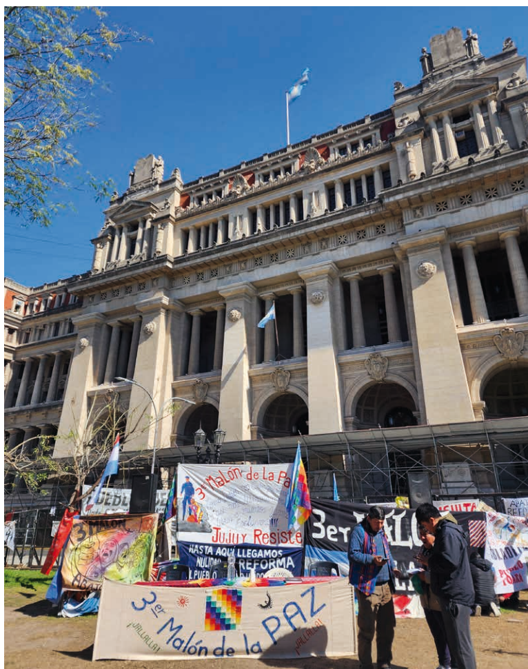
Demonstration of the Third Malón of Peace at the Supreme Court in Buenos Aires. August 26, 2023

On 14 June 2023, indigenous peoples undertook the third Malón de la Paz . 120 Under the slogan “Up with the Wiphala, down with the reform” and “Water is worth more than lithium”, various indigenous communities marched to demand respect for their rights in the constitutional reform process. The mobilisation that began in Abra Pampa, also known as the capital of the Puna region, ended on 16 June 2023 at the provincial Legislative Assembly in San Salvador de Jujuy. Upon arriving in the provincial capital, the indigenous peoples decided to continue with the public demonstrations indefinitely, after learning that, that same day, the Constitutional Convention had approved the constitutional reform project behind closed doors.