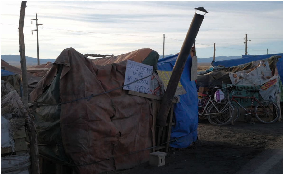
«A government of peace does not mistreat the people». Permanent roadside camps for indigenous peoples. August 2023

After the withdrawal of these provisions and the swearing in of the provincial Constitution, indigenous protests continued. The international fact-finding mission found that, more than two months after the adoption of the new constitutional text, a roadblock was still in place in Abra Pampa and around 67 communities from La Quiaca, Salinas Grandes, Susques, Humahuaca, San Roque and Purmamarca remained active. Some of them, such as the communities of Salinas Grandes and San Roque, set up permanent roadside camps, from which they informed passers-by of their resistance to the approved constitutional reform.